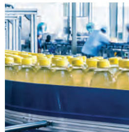
Juice and Beverage Processing