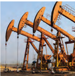
Oil and Gas Production