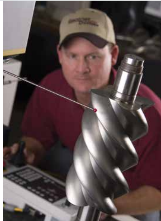
Critical Component Inspections = Quality Products

The CycloBlower stands out as the premium PD blower/vacuum pump in the market. The meshing of two helical lobe rotors synchronized by timing gears provides controlled compression of air for unmatched efficiency and shock-free discharge. State-of-the-art manufacturing techniques, improved assembly methods, and enhanced internal clearances allow the CycloBlower to operate at higher operating speeds for increased flow capacities. For optimal performance, we recommend AEON® PD and AEON® PD-XD (Extreme Duty for high ambient and/or high discharge temperatures) lubricants.