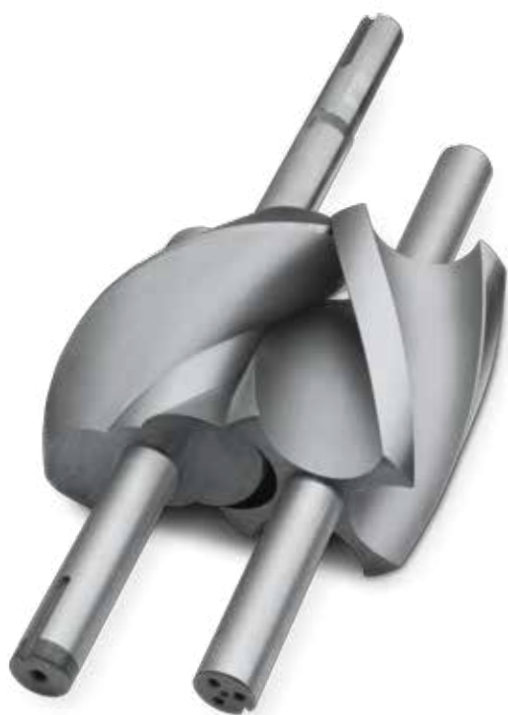
CycloBlower— Industry unique rotor profile

Dimensions shown in inches. Weights are in pounds and approximate.