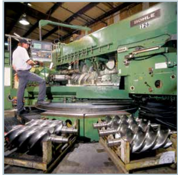
CycloBlower rotors are precision ground using state of the art milling technology.