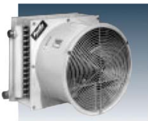
FanEx® air/oil, air/air, or air/water heat exchangers.