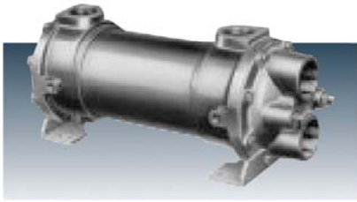
Pre-engineered shell-and-tube heat exchangers for general heating and cooling