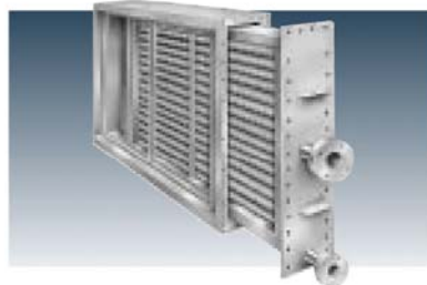
Heat transfer coils.