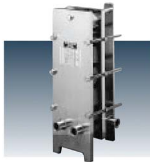
Plateflow® plate-and-frame exchangers.