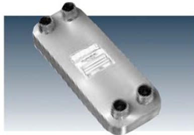
Brazepak™ compact, vacuum-brazed, general purpose heat exchangers.